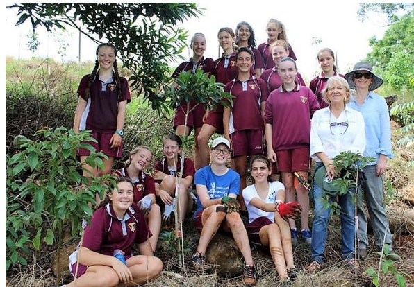
Richmond River schoolkids learning from OzFishers

OzFish Richmond River Chapter is making big steps towards improving their local waterway. A grant of $160,000 is being used to perform a hydrological assessment of the area. The study will act as an important tool in engaging stakeholders in implementing any future restoration activity. The chapter has also been working with the DPI in trialling a disease resistant strain of Sydney rock oyster for the Richmond. The aim is to restore a commercial oyster fishery in the river.