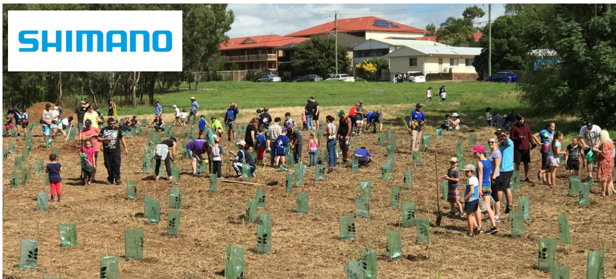
The Shimano Family Tree Planting Day on the Macquarie River

In April Shimano, partnered with us for a Family Tree Planting Day on the banks of the Macquarie River at Biddybunge Reserve. A total of 1,000 bottle brush, casuarinas and native grasses were planted by the local community in Dubbo.