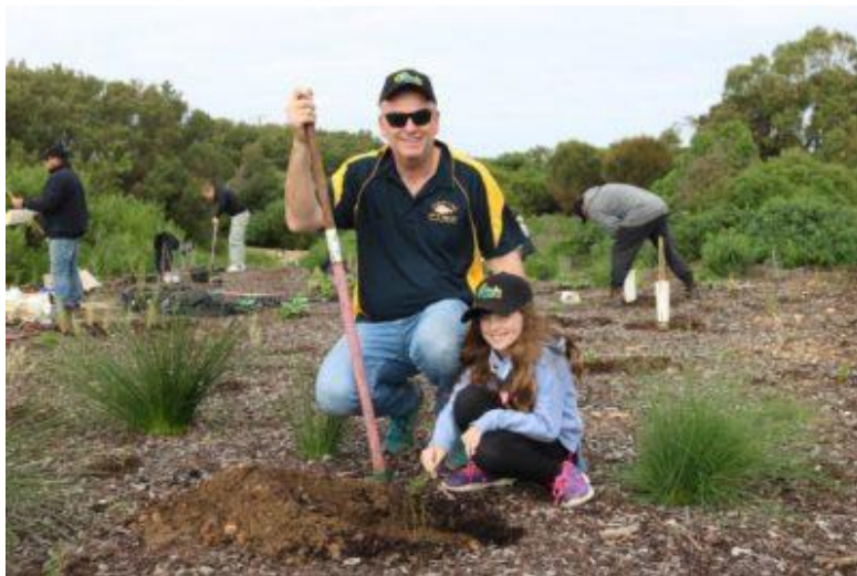
OzFish SW Victoria members getting their hands dirty on the Merri River

Our efforts on the ground are now being led by our growing band of recreational fisher champions as news of OzFish and our vision grows. On top of this a review of the OzFish Chapter members' volunteer hours committed to our cause last year has more than surprised on the upside and is testament to people's willingness to make big contributions of their time which we value highly.